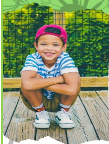
TINIES 4-6 YEARS