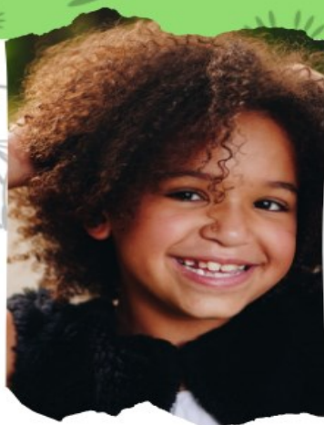
IN-BETWEENS 7-9 YEARS