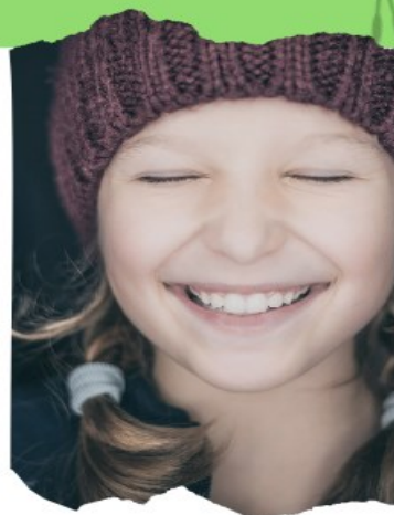
TWEENS 10-12 YEARS